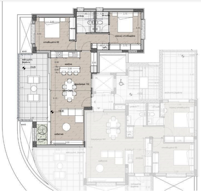
2-BEDROOM APARTMENT - TYPE B LAYOUT DESIGN