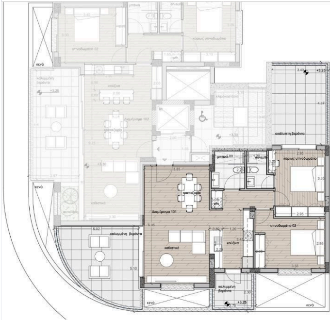
2-BEDROOM APARTMENT - TYPE A LAYOUT DESIGN